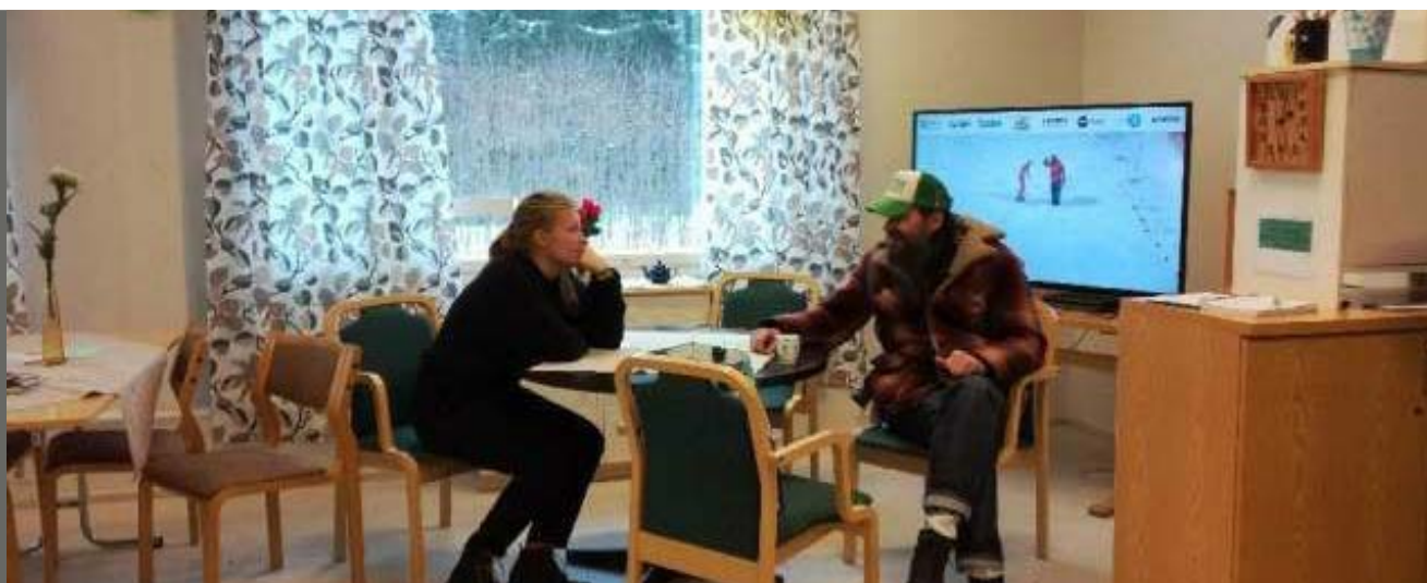
Images © The Finnish National Organization of the Unemployed/Cheers for Health, 2018